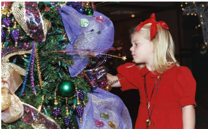
Touring the trees