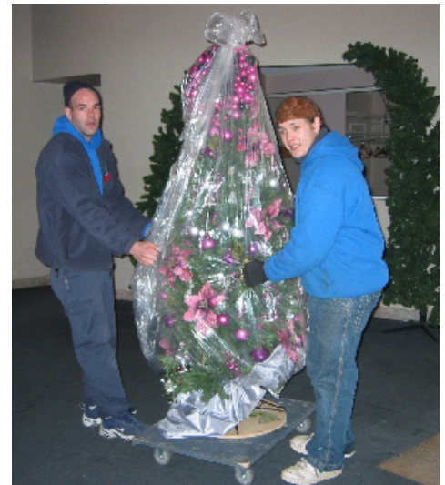
Highland assists with set up of trees

Highland Moving is proud to support and participate in Edmonton's favorite Christmas event!